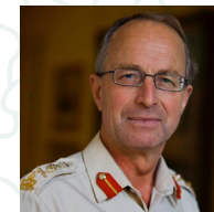
General The Lord Richards Former UK Chief of Defence Staff Chief of General Staff, British Army Senior Advisor to the International Institute for Strategic Studies