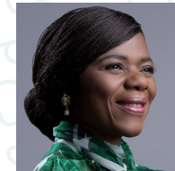
Prof Thuli Madonsela Professor of Law (SU) Formerly South Africa's Public Protector TIME100's 'Most Influential People in the World'